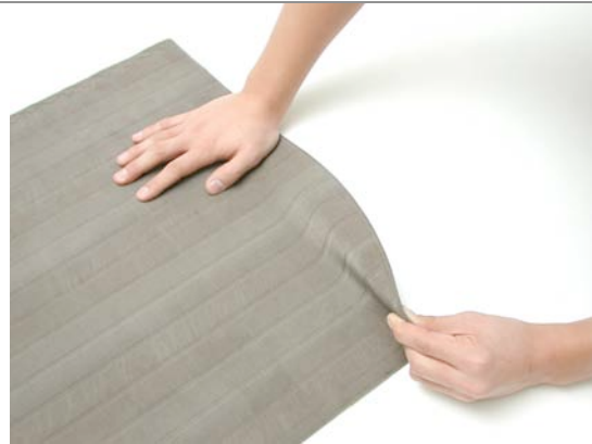
A Stretchable TactArray Sensor