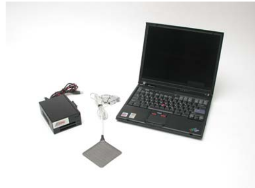
Complete TactArray System