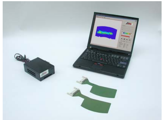
Complete TactArray System w/ 2 ITS Sensors (laptop not Included)