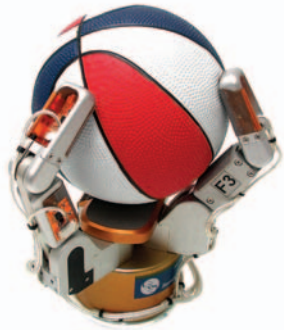
RoboTouch for BARRETHAND

PPS RoboTouch Sensors were developed to give BH8-series BarrettHand robotic hands the sense of touch.