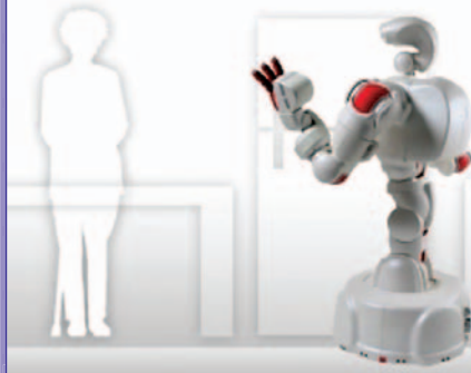
RoboTouch for TWENDY-ONE

Only five feet tall, but very powerful. Weighing in at 245 pounds with man-crushing arms, Twendy-One may have powerful cybernetic muscles, but thanks to the RoboTouch sensors, this robot is as gentle as she is strong.