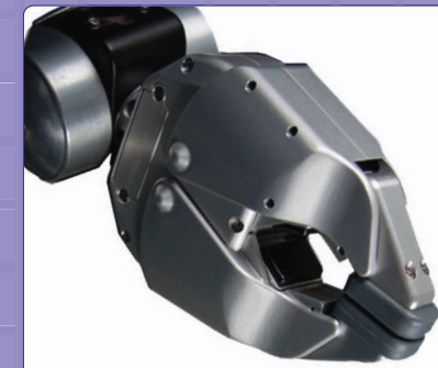
RoboTouch for PERSONAL ROBOT 2

RoboTouch sensors embedded in the Willow Garage Personal Robot 2 (PR2) help it pick up varying objects such as silverware, pens, to frying pans.